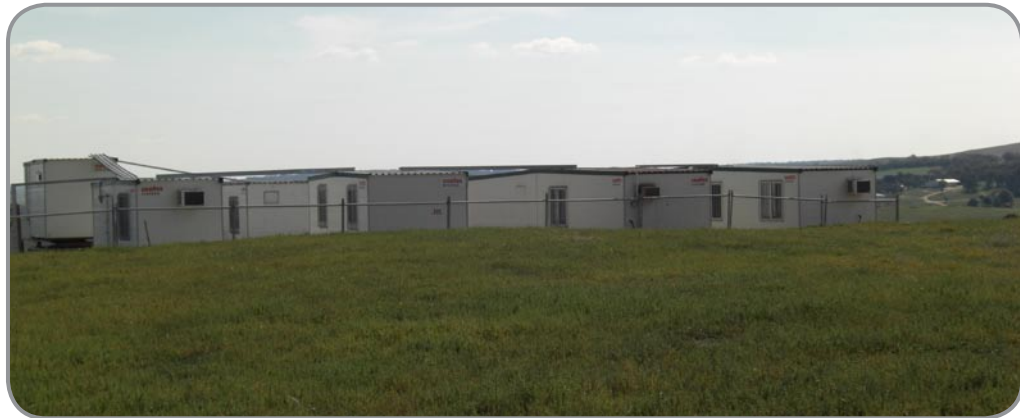
Construction has commenced at Crookwell 2

CDPL is a fully owned subsidiary of Union Fenosa Wind Australia Pty Ltd [UFWA]. Union Fenosa is an international energy group with a presence in 14 countries worldwide and with over 12,000 employees.