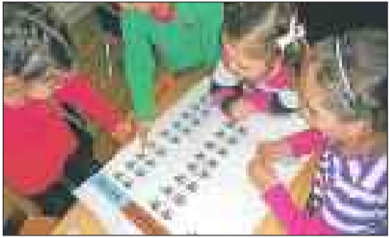
• Comparison – The children completed a picture graph – investigating eye colour.