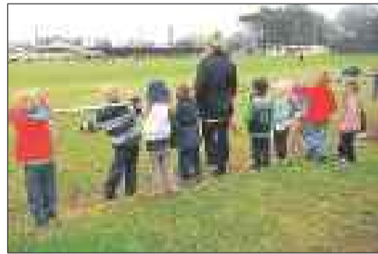
• Supporting community events – the children join the spectators recently watching the high school football team.