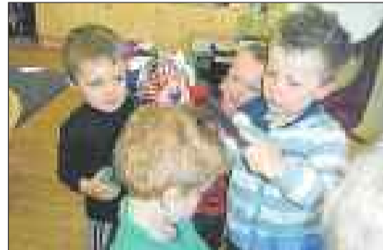
• Dramatic play – at the hairdressers attracts the boys.