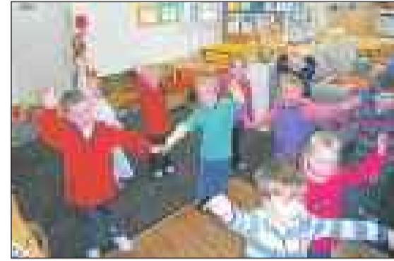
• Right: Yoga – Time to stretch and move.