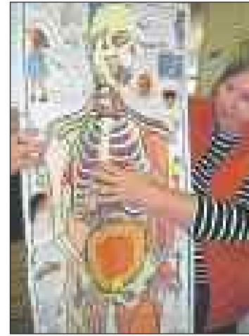
• What's inside my body? We have been learning about living things/my body and our 5 senses.