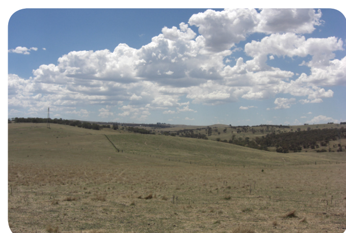
6. Transmission line from highest point