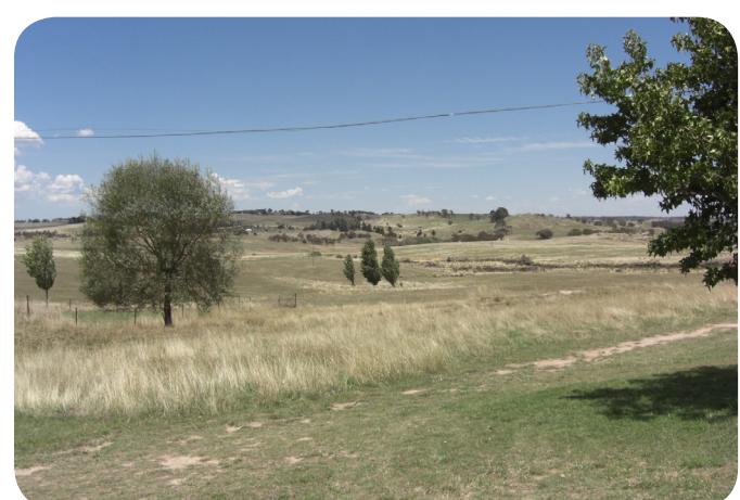
2. Typical landscape of Crookwell 3 South