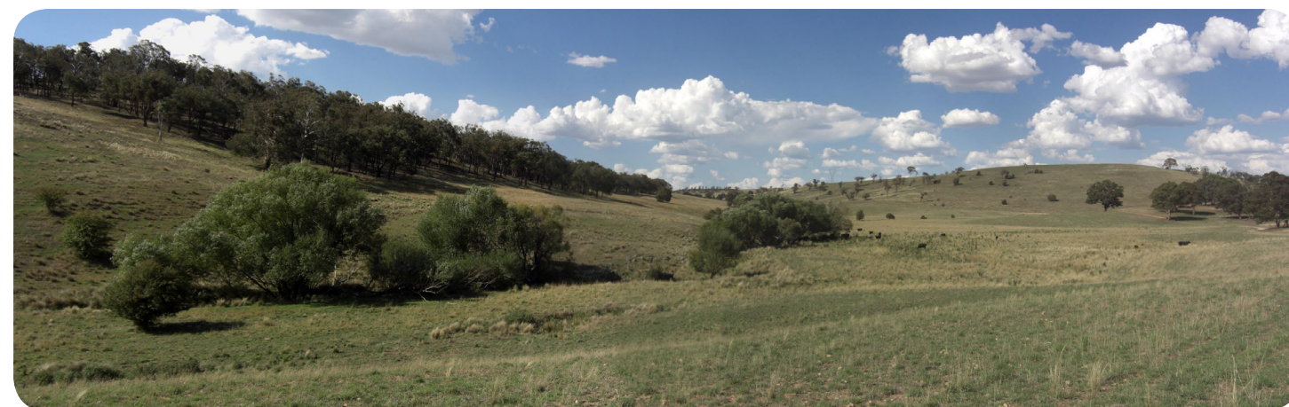
9. Site from western access point