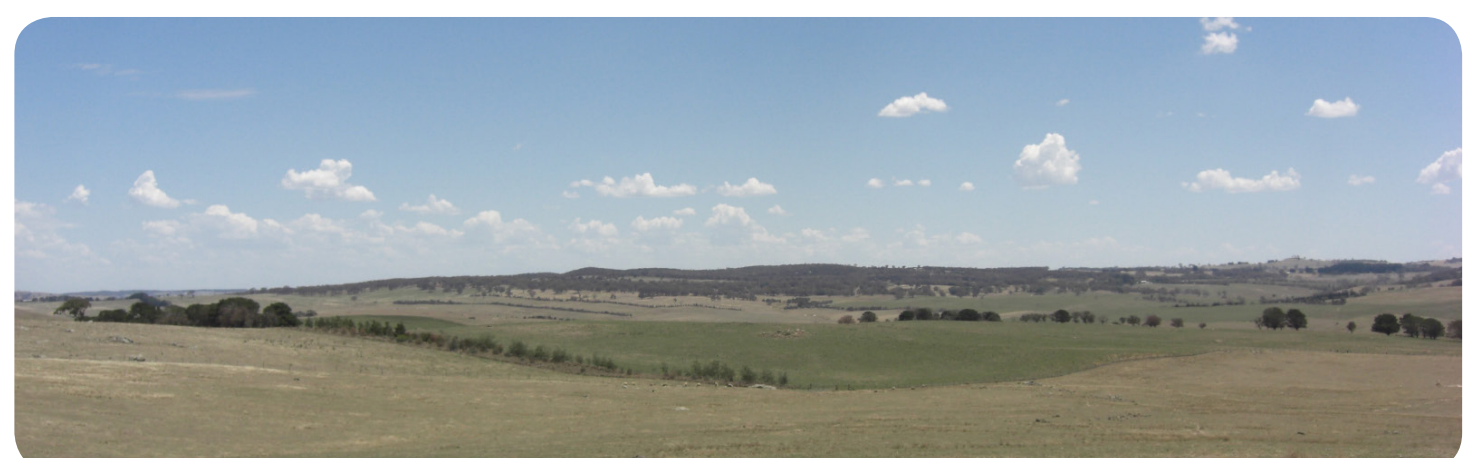
7. Looking north from centre of Crookwell 3 South