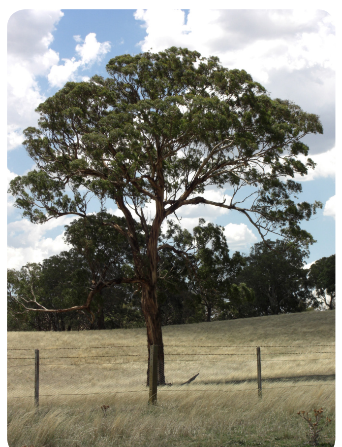
9. Yellow Box (remnant vegetation)