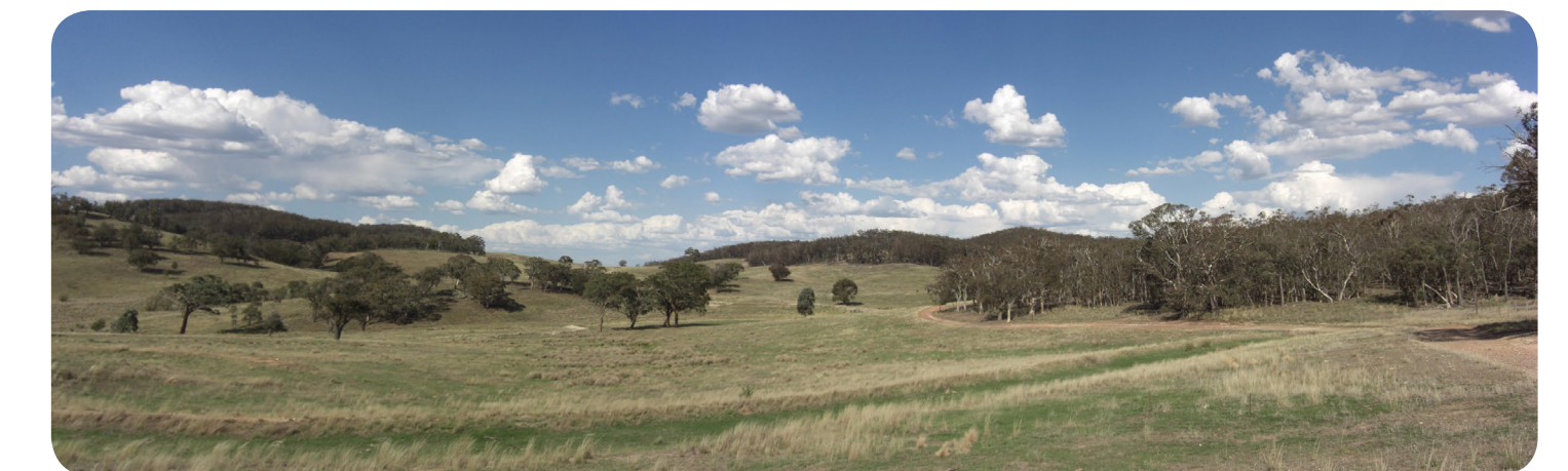
11. View south from northern boundary