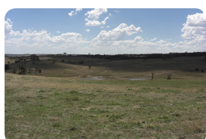
5. View east with Dam in foreground