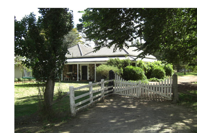
8. Hillview Homestead