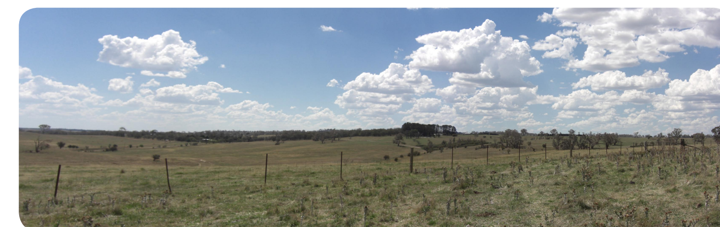
3. Typical landscape from hilltop