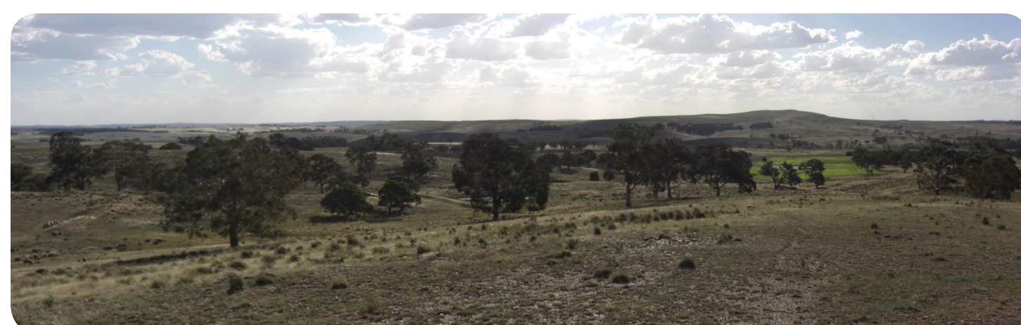
15. View west from central southern portion of site