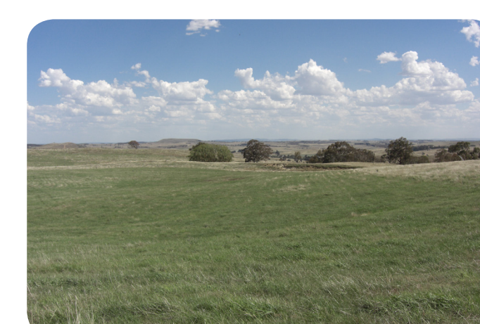
7. View south along drainage line to Dam