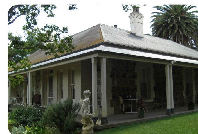
2. Leeston Homestead