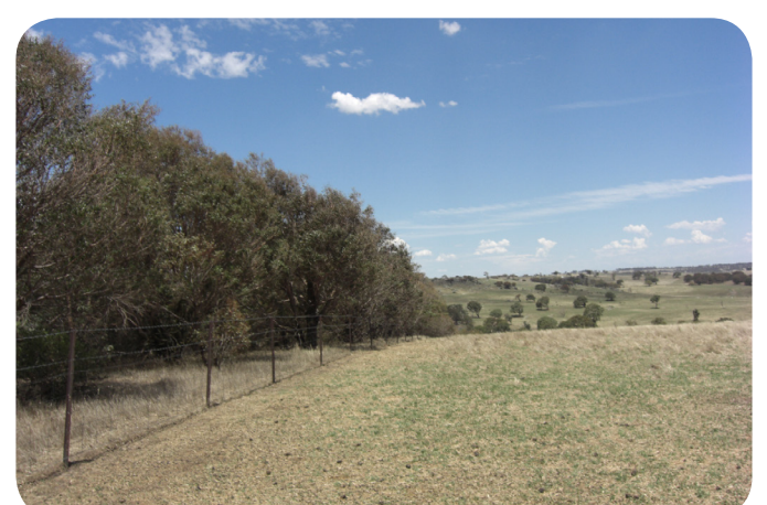
4. Planted wind break