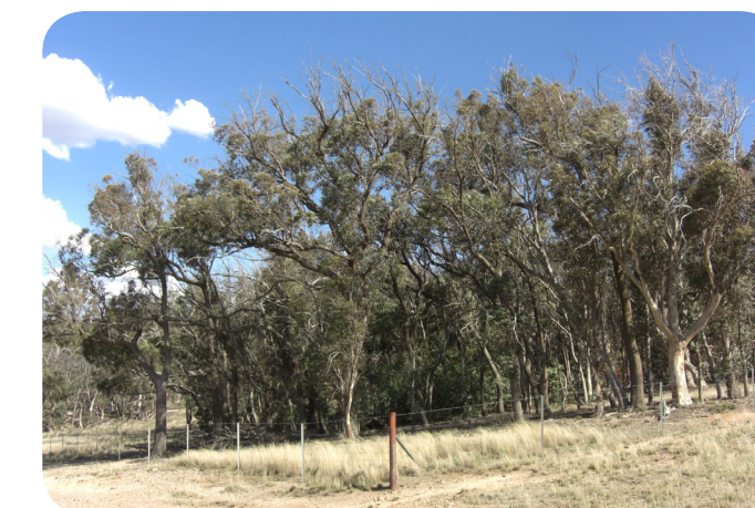
10. Fenced reserve