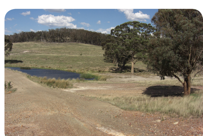
12. Dam with Willowvale Hill in background