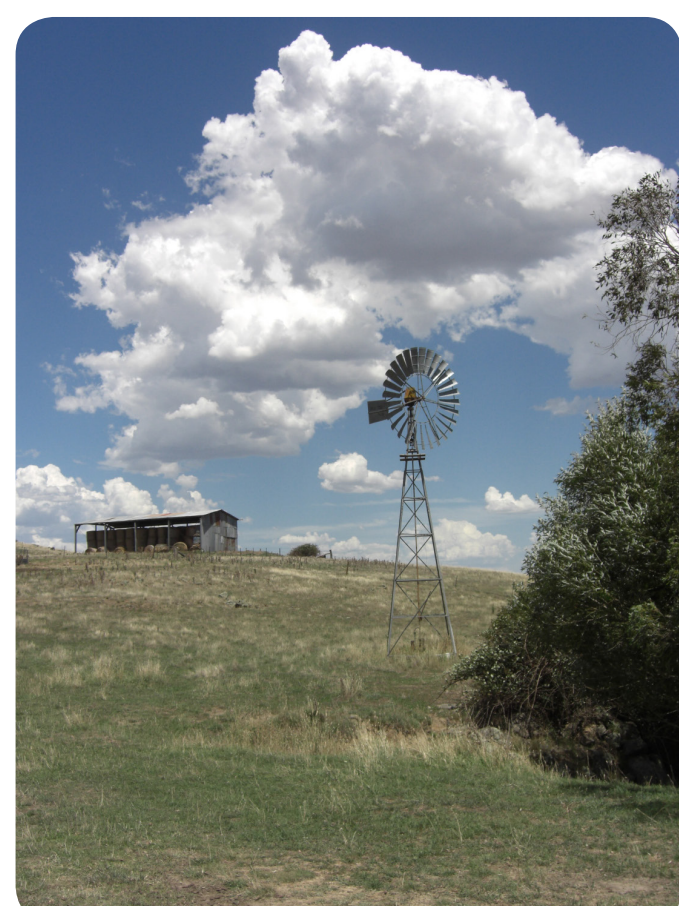
8. Wind mill and shed