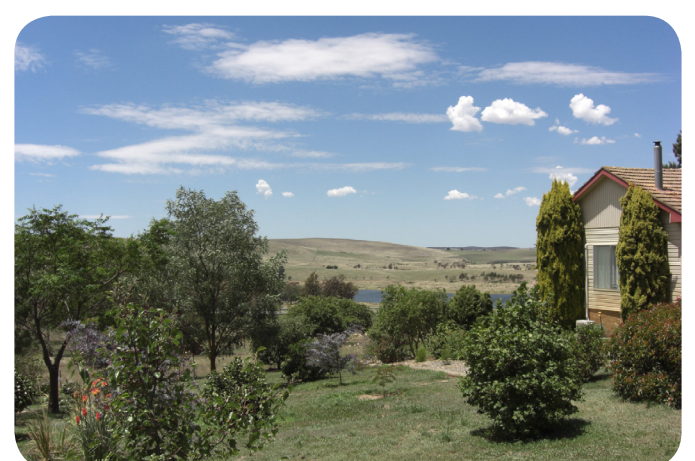
1. View east to Pejar Dam from landowners dwelling