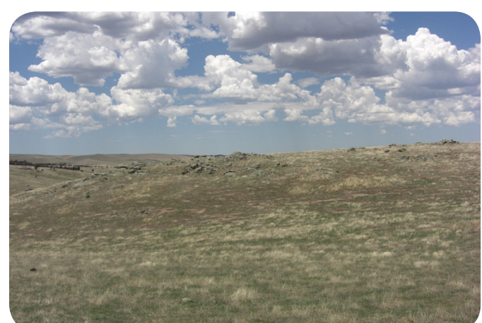
5. Rocky hilltop