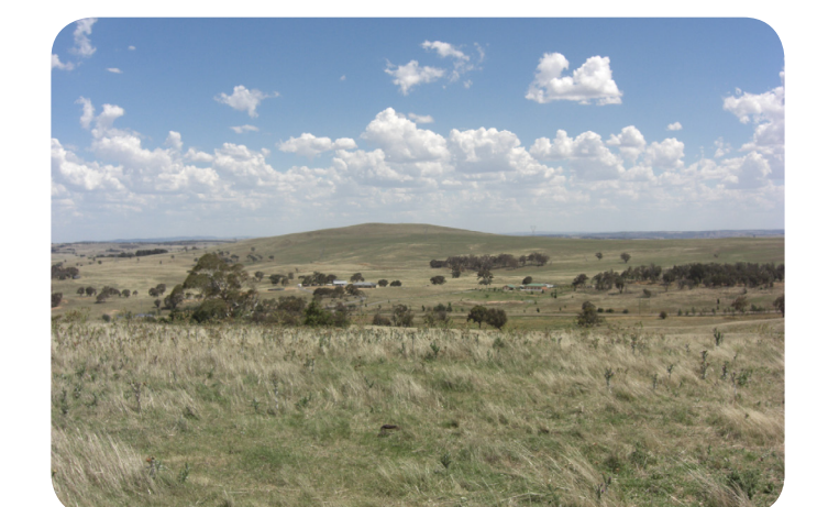
4. Pigman's Hill from hilltop