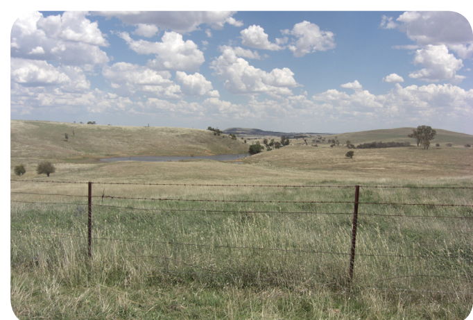
1. View to Dam from Boltons Road