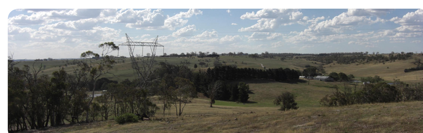
13. View to non-participating dwellings from northern boundary