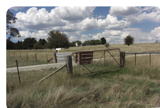
6. Intersection of Bolton's Road and property boundary