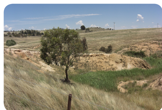
3. Drainage line