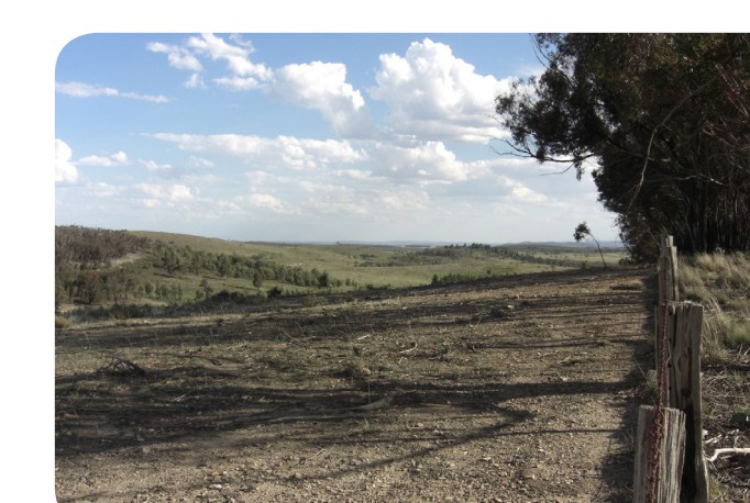
14. Potential access road at eastern boundary