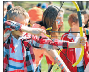
OLYMPICS: Gold, silver and bronze medals were presented to Oberon Public School students at an assembly.

The students then parents and guests to attended a special morning tea with their celebrate their award-winning occasion.