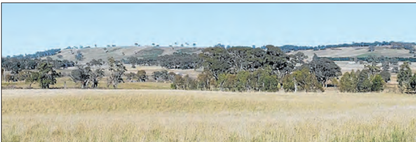
• Looking across the beautiful Kialla Valley.

IN the early hours of Saturday morning in very windy conditions, a fire was lit on the asphalt in Kialla Road near the McDonald Street intersection. Bottles and cans were thrown into the fire and broken glass was spread over a wide area on both sides of the street. The fire was put out by a reasonably heavy fall of rain which caused the group to disperse. Police are investigating.