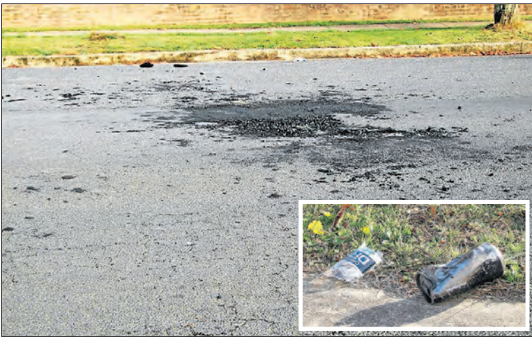
• What is left over of the fire lit on Kialla Rd during the early hours of Saturday morning. Inset: Broken glass was spread over a wide area on both sides of the street.

IN the early hours of Saturday morning in very windy conditions, a fire was lit on the asphalt in Kialla Road near the McDonald Street intersection. Bottles and cans were thrown into the fire and broken glass was spread over a wide area on both sides of the street. The fire was put out by a reasonably heavy fall of rain which caused the group to disperse. Police are investigating.