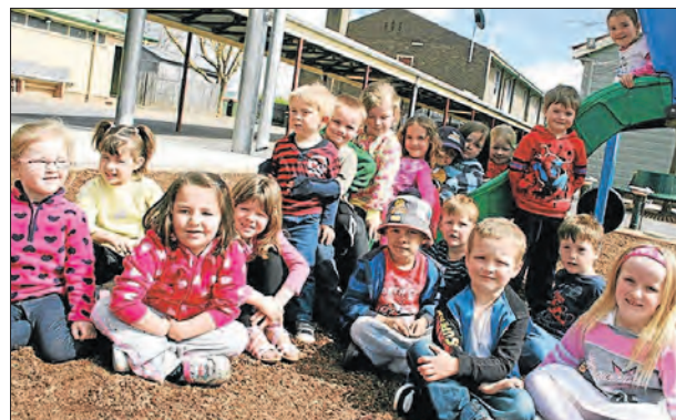
• Some of the children who participated in Crookwell Public School's Flying Start Program at the base of the very popular slide in the fixed equipment area. The Flying Start program concluded on the last Monday of Term 3. The well attended session was lots of fun for everyone with the little Flying Starters happily playing on the fixed equipment in the Spring sunshine. We are really looking forward to spending more time together next term when our little Flying Starters return on Monday 12th November, 2012 for the week long 2013 Kindergarten Orientation Program.