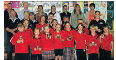
AWARDS: Oberon Public's outstanding school citizens.

These special awards celebrated all aspects of school life.